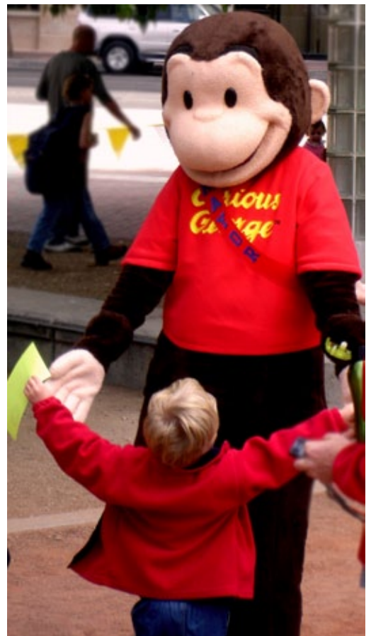
A big fan greets Curious George at Story Town 2009. Pirate picture inside!

All the children took home new free books, and families left with information about reading to their young children--starting at birth--every day. The information distributed was part of the new Read to Me, Arizona! public awareness campaign. To learn more about the campaign and resources for reading aloud to children, visit readtomearizona.org .