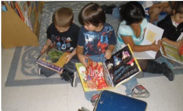
Children at Kids World (Yavapai) get right into the books in their new library.